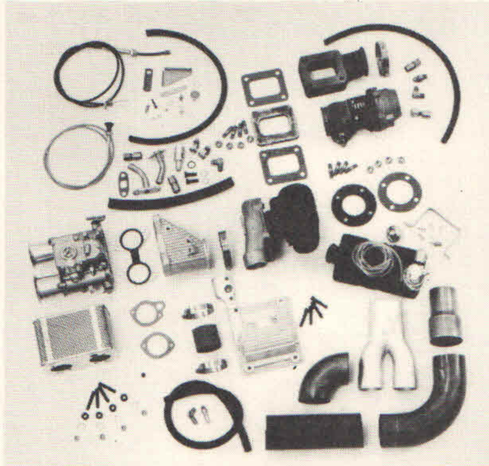
V-8 General Installation Kit